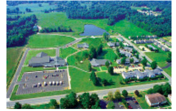
The campus of Brehm Preparatory School.

We have had quite the winter here at SOAR- including record cold and a few storms that left over a foot of snow covering our base camp! Needless to say, we are more than ready for summer to start and for kids to begin arriving.